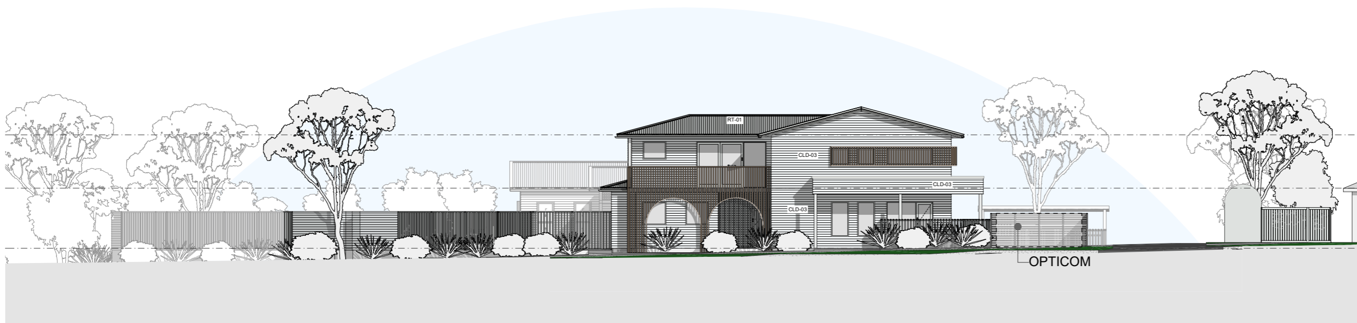
1 North Elevation Scale 1:200