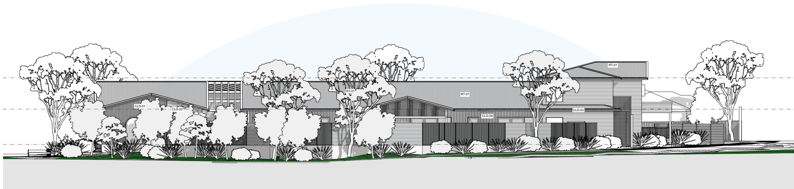
2 East Elevation Scale 1:200