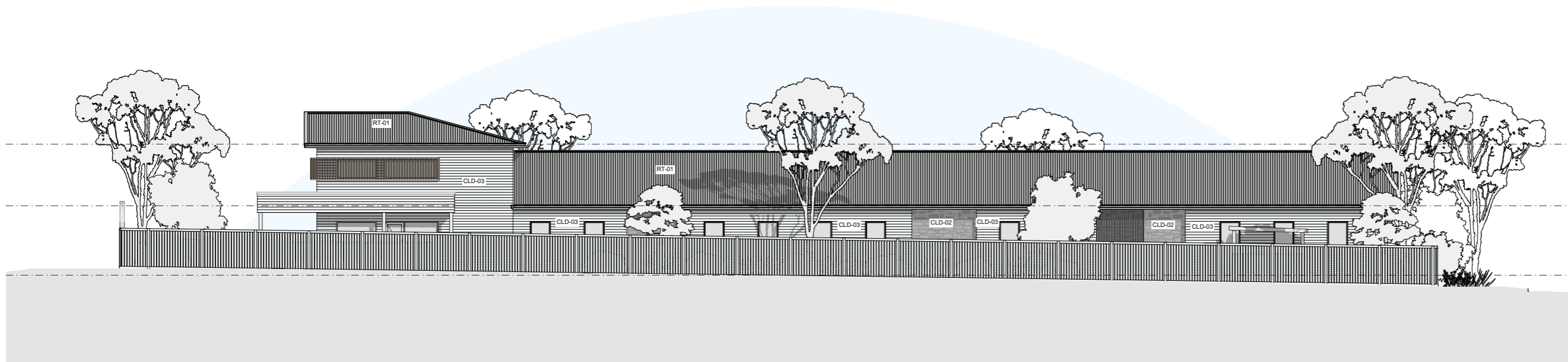
2 West Elevation Scale 1:200