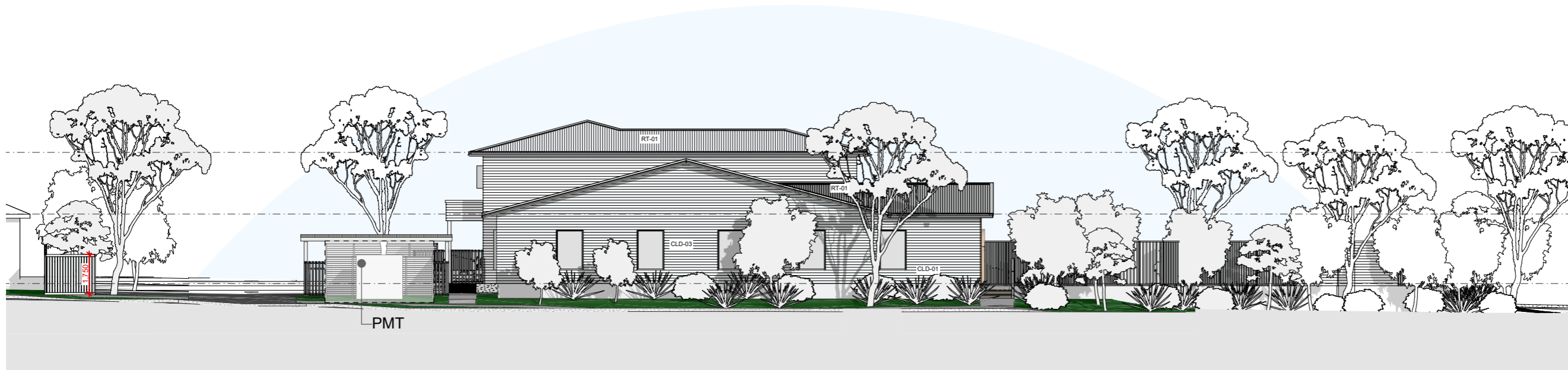
1 South Elevation Scale 1:200