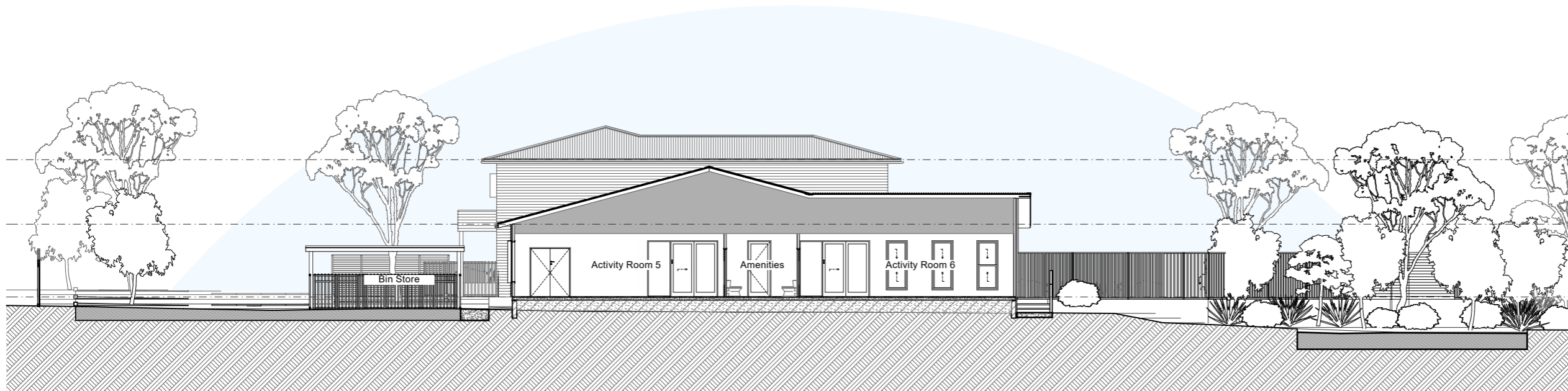
2 Section B Scale 1:200