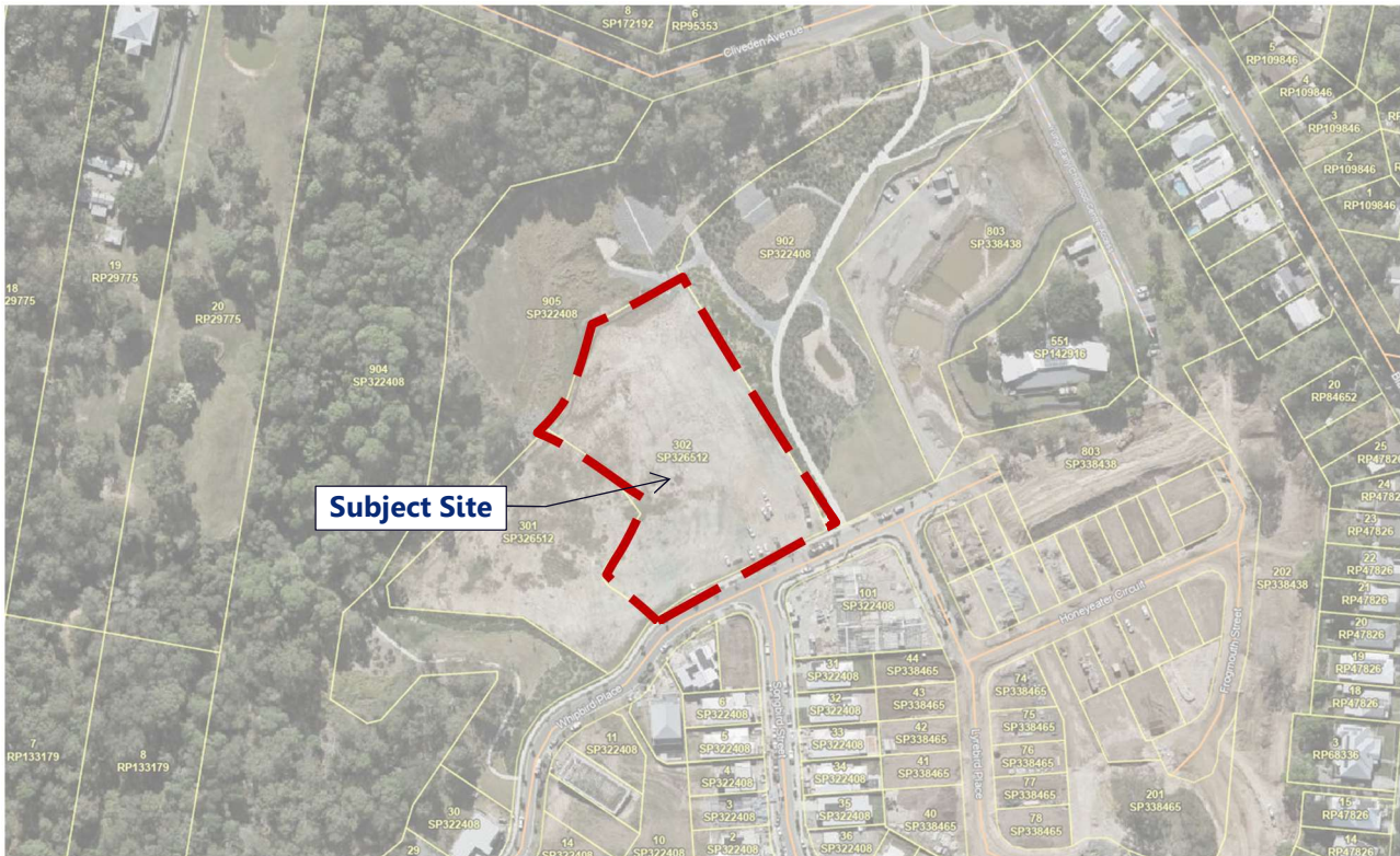
Figure 2.1 – Locality Plan

The subject site is located at 10 Honeyeater Circuit, Oxley, on land described as Lot 302 on SP326512. The site has an area of approximately 9,644m 2 and is located within the Brisbane City Council local government area and the Oxley Priority Development Area (PDA).