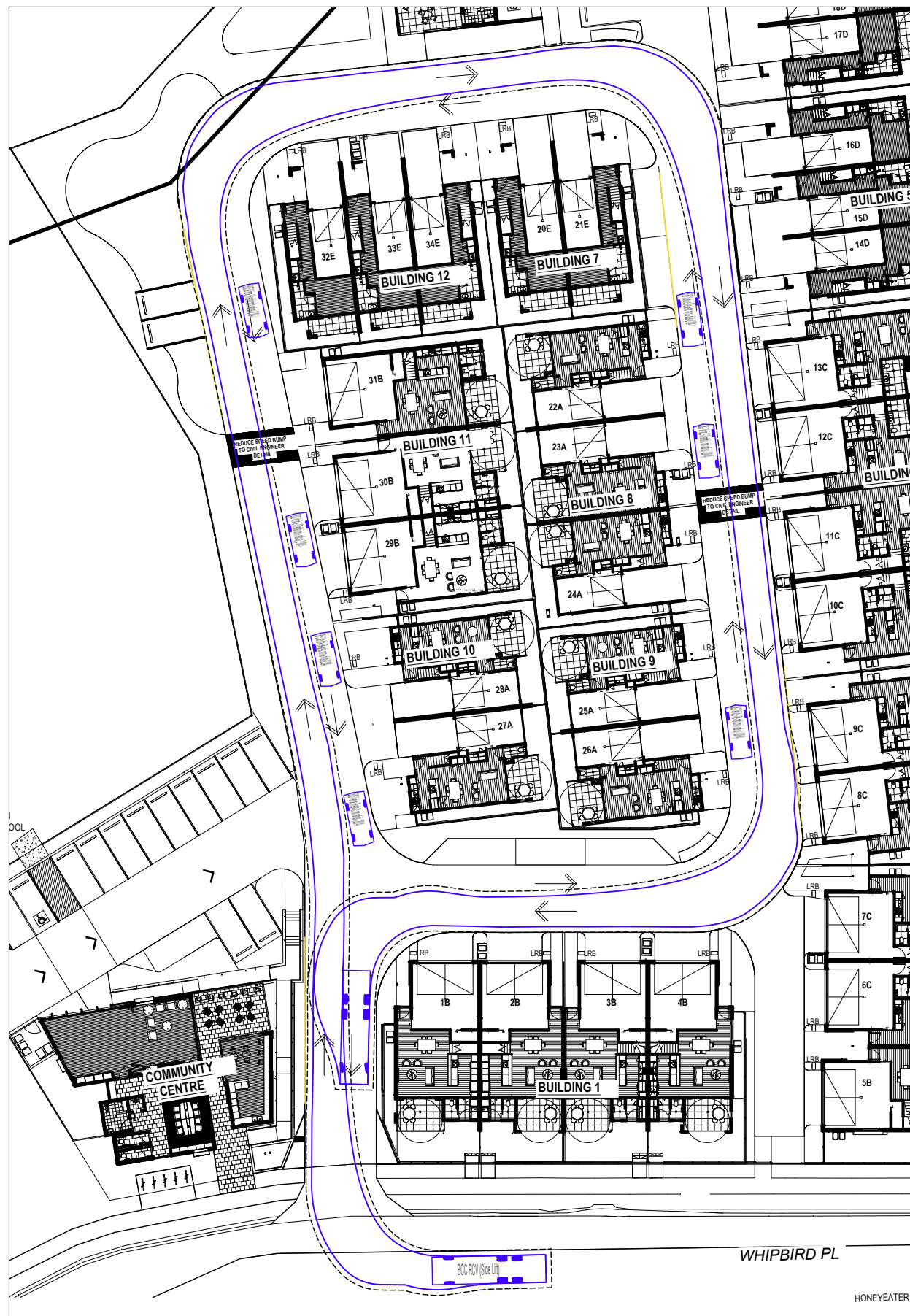
RCV PASSING CAR