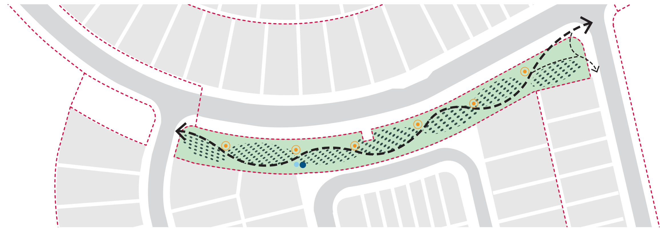
PARK LOT 841 LINEAR PARK CONCEPT PLAN