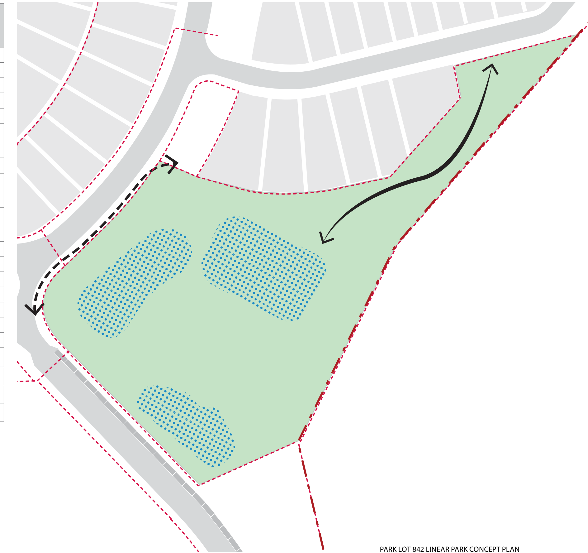
PARK LOT 842 LINEAR PARK CONCEPT PLAN