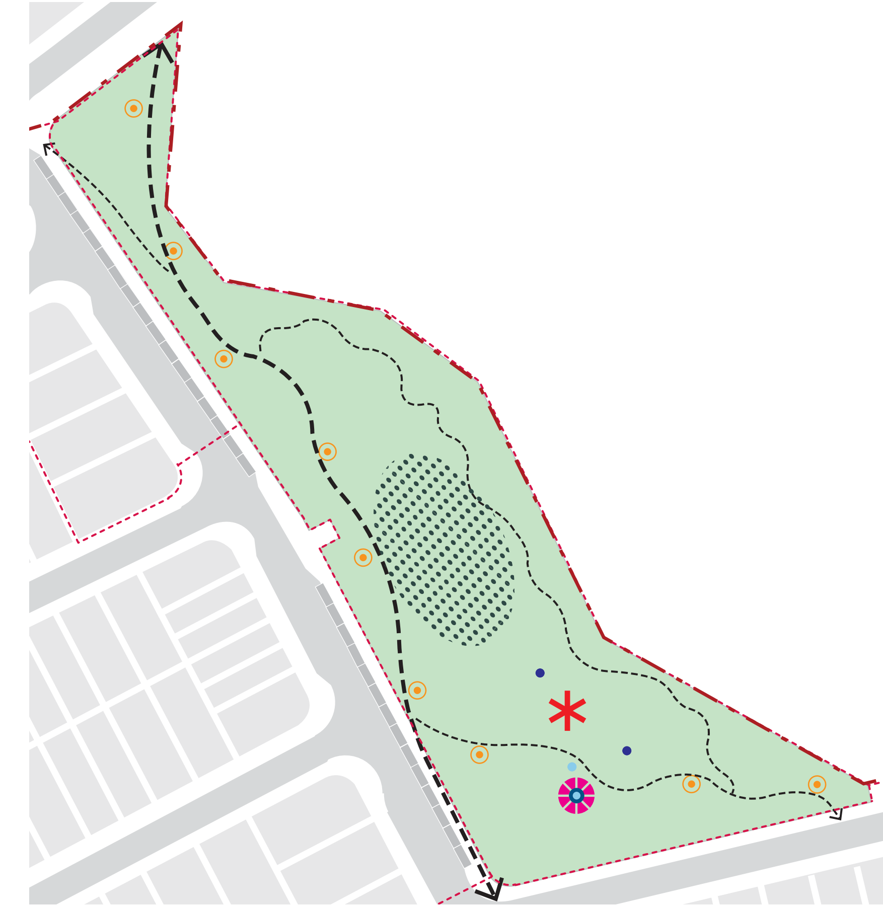
PARK LOT 840 NEIGHBOURHOOD PARK CONCEPT PLAN