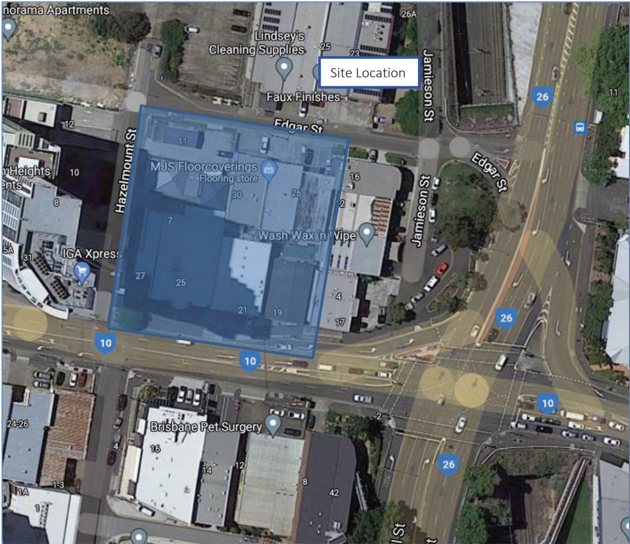
Figure 1.2: Site area, Source: Google Maps