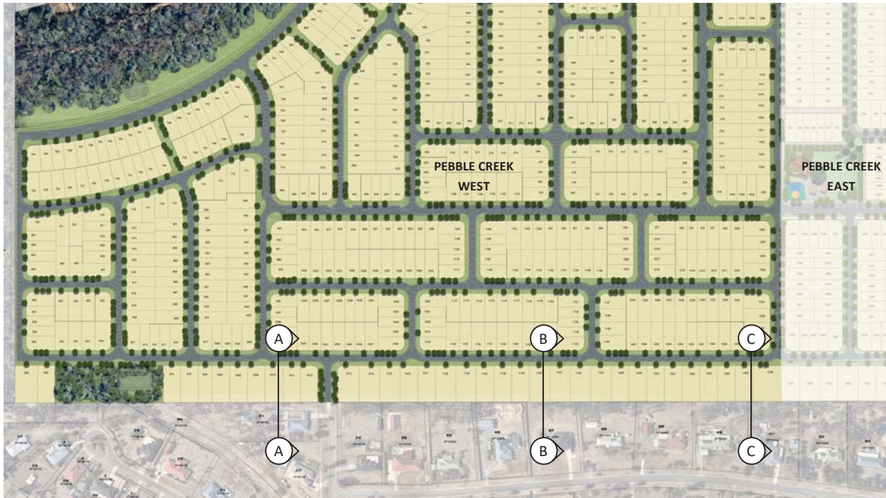
LOCATION PLAN N.T.S

LANDSCAPE SECTIONS PACKAGE Mountain Ridge Road, South Maclean QLD ORCHARD PROPERTY GROUP